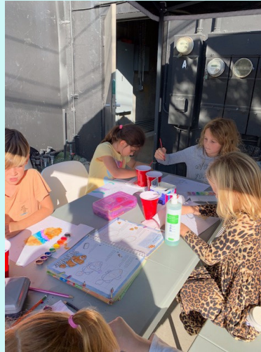
Artists hard at work!