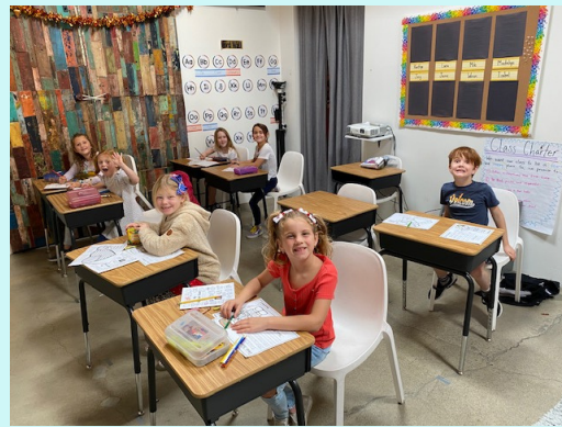
1st Grade scholars writing letters to Veterans.