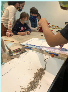
4th Grade California map project

When dishes are sent in please note if your family dish contains any nuts as we have a few nut allergies on campus.