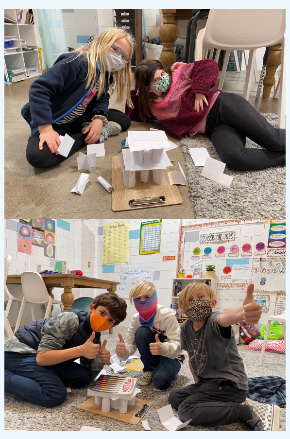
2nd grade scholars working on an engineering project