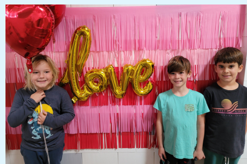
1st Grade getting into the holiday spirit