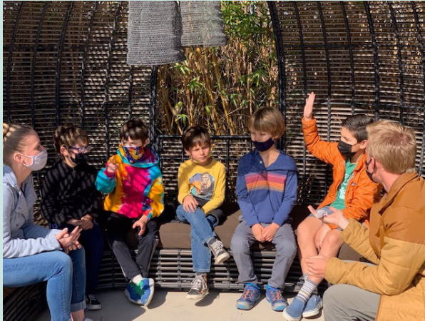
3rd Grade Scholars bring their reptile unit to life with a visit from "Blue the Gecko".