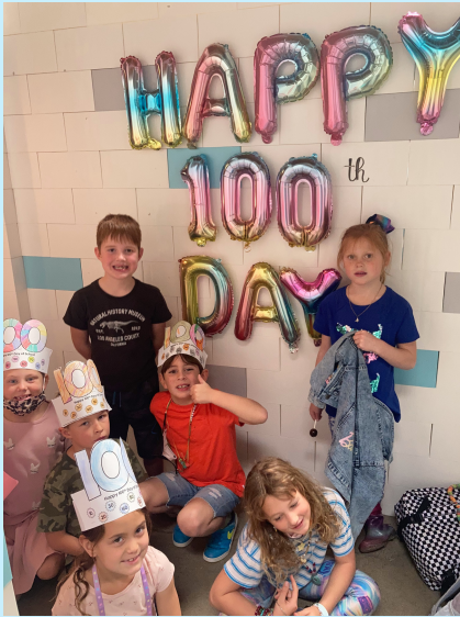
1st Grade Scholars celebrating 100 Days of School!